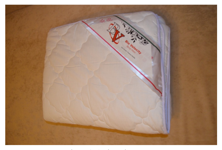
Figure.1. Activated mattress.

This work is devoted to revealing the differences between the states of patients with psychophysiological insomnia using an ordinary mattress (OM) with a basis of cotton eco-friendly materials of filler and cover and using the similar matresses but exposed to activation (AM) in the area of natural energy fields in Malaysia within 1 day, so called AM therapy (Figure 1). Activated mattress contains the optical memorable material received from a mix of the photoaddressed polymer and, at least, one additive. A certain ratio of the influences having various directions of polarization is written down in the optical memorable layer by means of the polarized light. Technical result is storage of favorable electromagnetic influence impact on a mattress and a resonance at useful frequencies for the person.