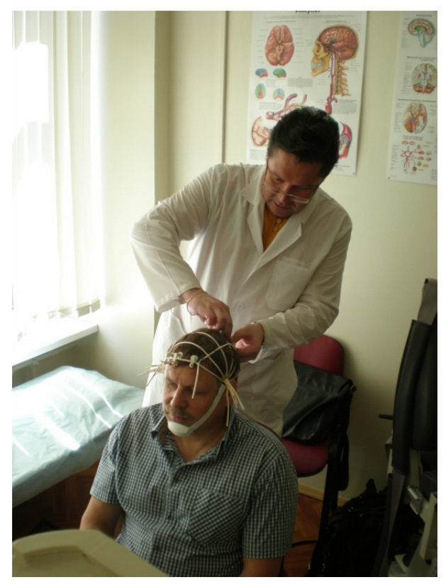
Figure 5. The process of EEG study

Compared with the initial data, a more clear response to the process of opening-closing of the eyes is observed on the EEG pattern after AM-therapy. There is a greater representation of the beta rhythm in the anterior (front) leads. These changes indicate a full-fledged functioning of the cerebral cortex.